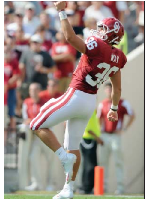
P Tress Way