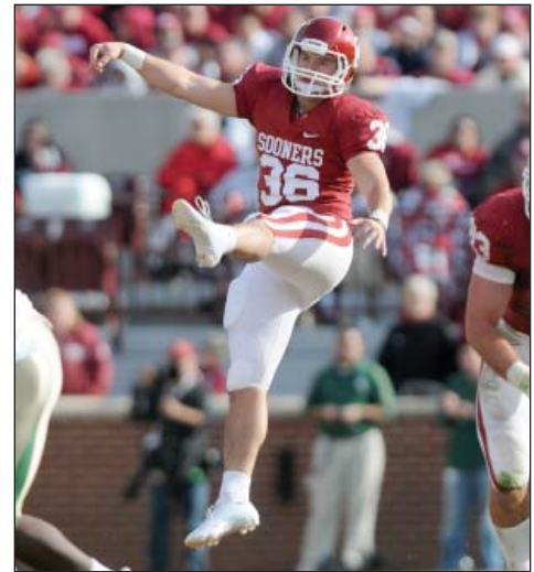
P Tress Way