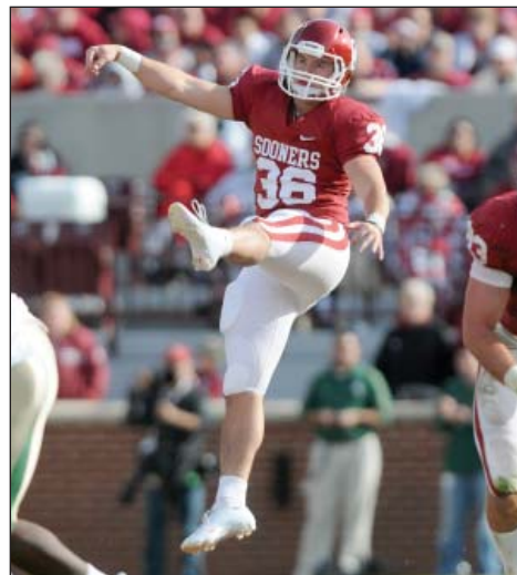
P Tress Way

As good as Oklahoma was at returning punts, the same could not be said of the Sooner opponents. The Sooner foes ran back just 17 punts for a paltry 30 yards. That 1.76-yard average ranked No. 2 nationally. • Oklahoma was No. 5 in net punting nationally at 40.3 yards per kick. • The longest punt return OU surrendered last season was 19 yards, which occurred on just one occasion. No other punt return during the season exceeded six yards. • In the 2010 opener, Utah State returned one punt for zero yards. Florida State had two for one yard.