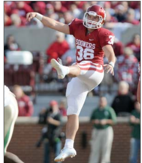
P Tress Way

• The longest punt return OU surrendered last season was 19 yards, which occurred on just one occasion. No other punt return during the season exceeded six yards.